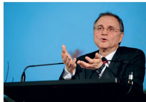
Ignazio Visco, Governor of the Bank of Italy

In his concluding remarks, Ignazio Visco, Governor of the Bank of Italy, distinguished between the 2007 crisis in the financial industry, caused by a lack of proper regulation, and the euro area government crisis. In his view, single countries